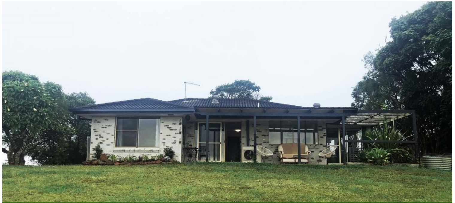
Lot 5 East Rd, Dunoon